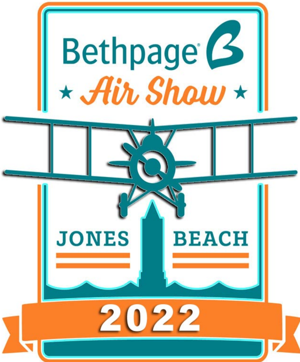
[[ Bethpage Air Show 2022 Main display New York State College of Agriculture and Mechanic Arts, Bethpage, New York, USA, September 10-11, 2022.]]